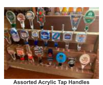
$30.00/each Kevin Brain