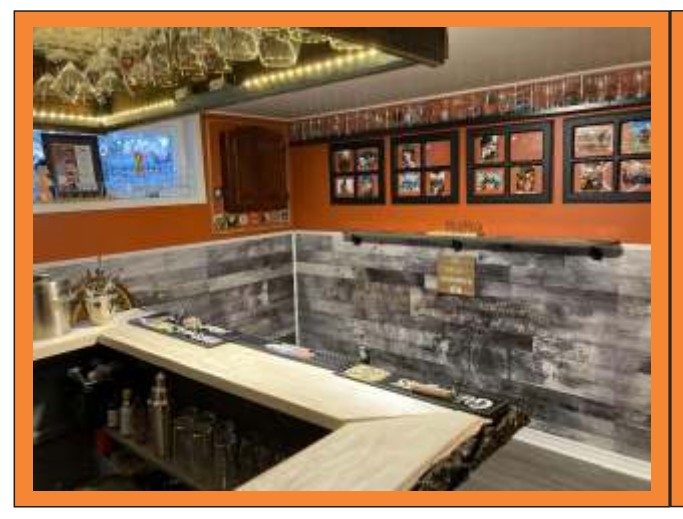
Darts, Drink Rail and more beer glasses. Note: Picture frames are made from our old bar top.