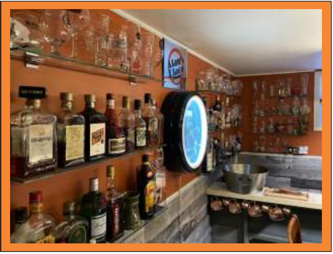
Bar back glass shelves. Homemade Guinness Clock. The first part of our beer glass collection.