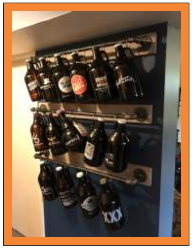
Just before you enter the bar area is our Growler display.