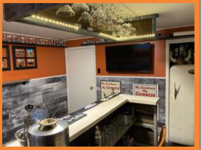
Entertainment, Karaoke wired right in. Our Amazing 1950's beer fridge.